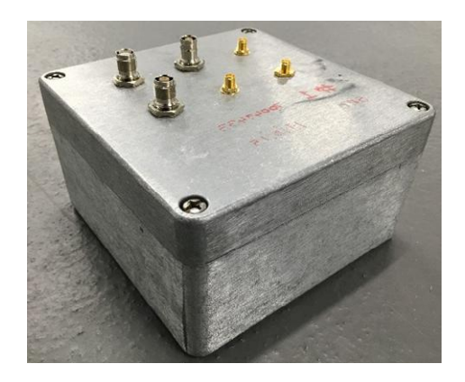
Figure 1 – Supplied enclosure with coaxial bulkhead connectors fitted